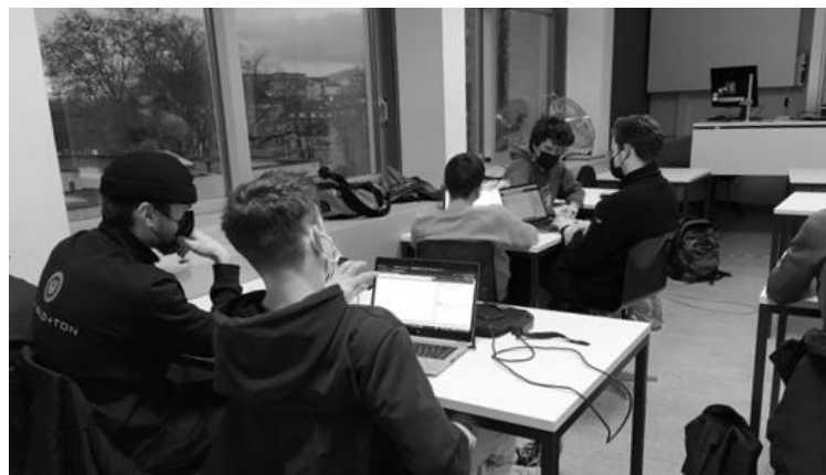
Figure 3. Classroom experiment: Student groups working collaboratively with the chatbot Tubo

At the beginning of the first lesson, the students formed four groups (usually three people per group). Each student had their own laptop to work on. After a short thematic introduction by teacher B, each student was asked to access the chatbot tool through the web browser and log into their group. This worked well for most students and the chatbot welcomed the group members. Figure 3 illustrates how the students worked during the lessons with Tubo in small groups.